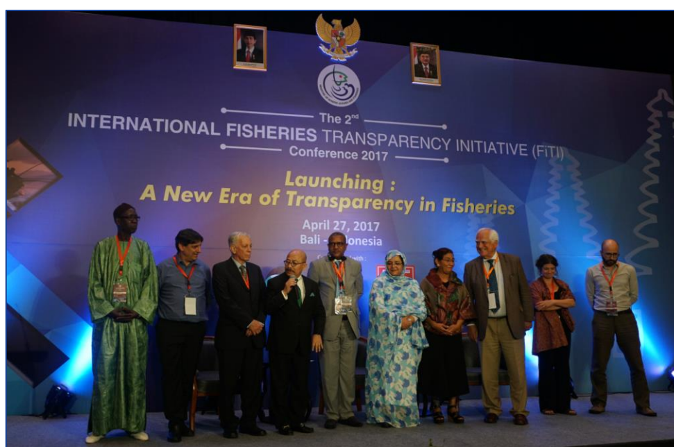
Representatives of the 1st FiTI International Board, with H.E. Susi Pudjiastuti

The Board currently comprises of 14 representatives from government, business (small-scale and large-scale) as well as organised civil society.