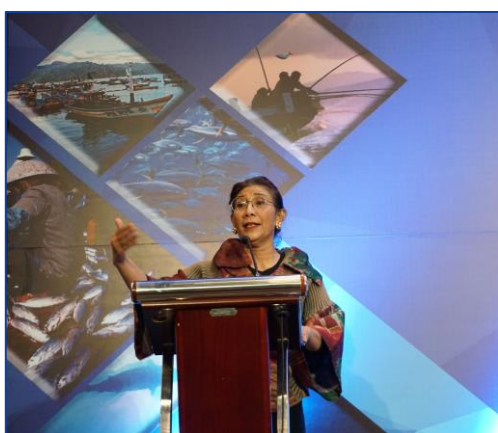
H.E Susi Pudjiastuti, Minister of Marine Affairs and Fisheries of Indonesia

On the invitation of H.E. Susi Pudjiastuti, Minister of Marine Affairs and Fisheries of Indonesia, over 200 participants from governments, the industry, small-scale fishing associations, civil society organisations, academia and media met in Bali.